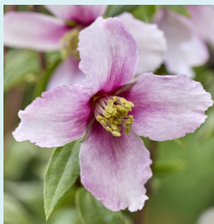
Chelsea plant of 2025 is "Philadelphus Petite Perfume Pink"

(top shoots usually inhibit side growth by a hormonal process known as apical dominance)